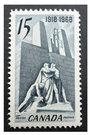
Figure 6 The Vimy Ridge monument.

Offensive. Both the French and British armies had attacked and failed to win Vimy Ridge, prior to 1917. The success of the Canadian Corp led to the ceding by France of about 100 acres of battlefield to Canada to construct a memorial of the battle. Unitrade #486 shows the monument built on the Ridge.