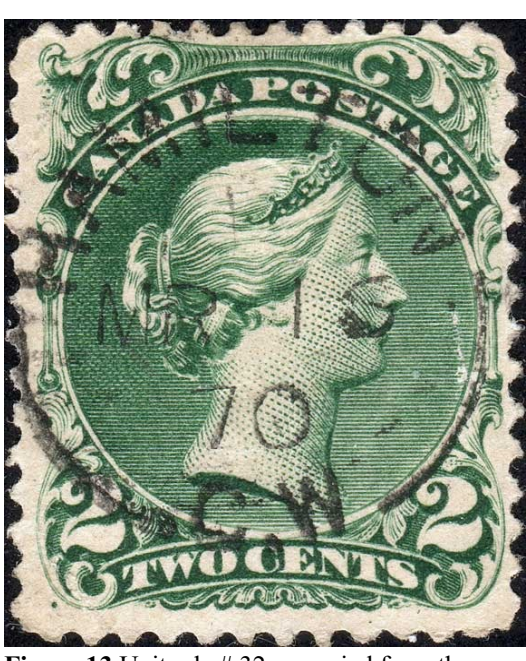
Figure 13 Unitrade # 32 as copied from the VGG Foundation website.