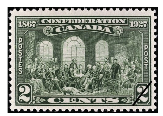
Figure 14 In honour of the Canada 150, Unitrade # 142 issued to honour the 60th anniversary of Confederation.

When you have a chance, why not visit the club web site at <a href="www.owensoundstampclub.org">www.owensoundstampclub.org</a>. Feedback is always important to keeping this means of connecting up to date. The only way to end a newsletter is with another picture of our common obsession, stamp collecting!