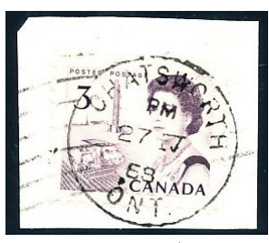
Figure 10

saw an opening for Post Master in Walters Falls and became the Post Mistress there. That is how they met each other and the rest is history, so to speak. The Chatsworth Post Office is still going strong with its own cancel.