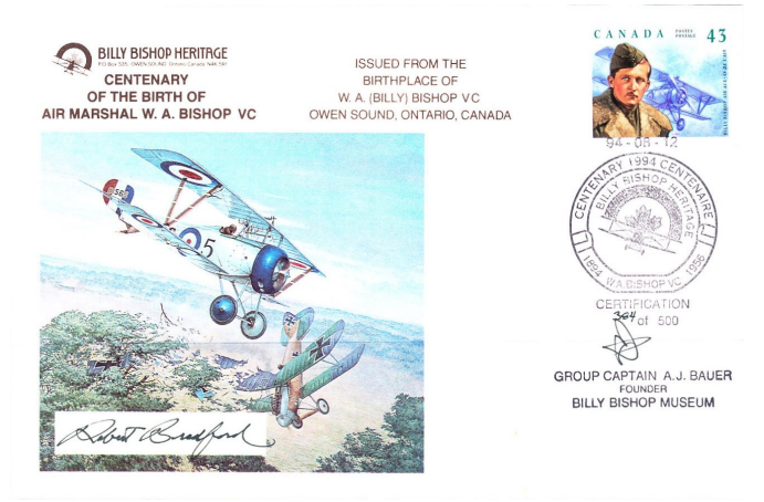
Figure 4 The Billy Bishop Commemorative cover from the collection of JCL.

One of the best starting points is this commemorative cover of Billy Bishop. The stamp is catalogued in Unitrade as #1525 and was issued on August 12<sup>th</sup>, 1994. The cancel itself is not considered to be an official First Day cancel but the date of the cover is given on the first day of issue. The Unitrade catalogue calls the two stamps issued in se-tenant pairs as "Great Canadians." To begin with the stamp of discussion, Billy Bishop was born in Owen Sound and served in the Canadian Army before transferring to the Royal Flying Corp. Ultimately, Bishop was awarded the Victoria Cross medal for his bravery as a pilot.