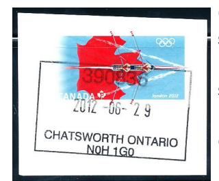
Figure 11 From the editors collection

Canada Post issued a stamp showing the Lancaster bomber as part of a series showing military aircraft. Unitrade #874 was issued on November 10<sup>th</sup> 1980 and is in a se-tenant pair with the Voodoo from the 1950-60's. The building of the Lancaster was completed in