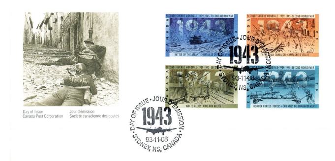
Figure 12 The Lancaster bomber is featured as part of #1504 (stamp on the bottom right hand corner) as well as in the cancellation of the FDC. From the collection of JCL